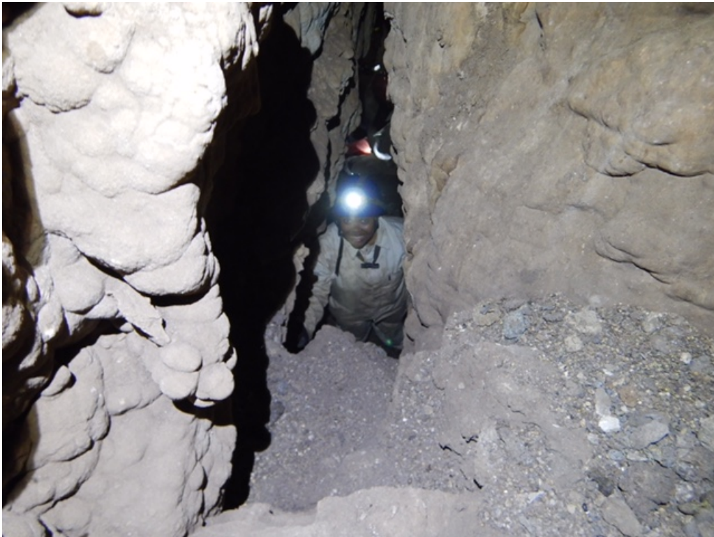
Top: Nompumelelo Hlophe goes through a "squeeze," which leads to a bigger chamber at Gate Keeper Cave. Bottom: Nompumelelo Hlophe stands in Gate Keeper Cave. It is called Gate Keeper Cave because there is a big porcupine that stays by the entrance.