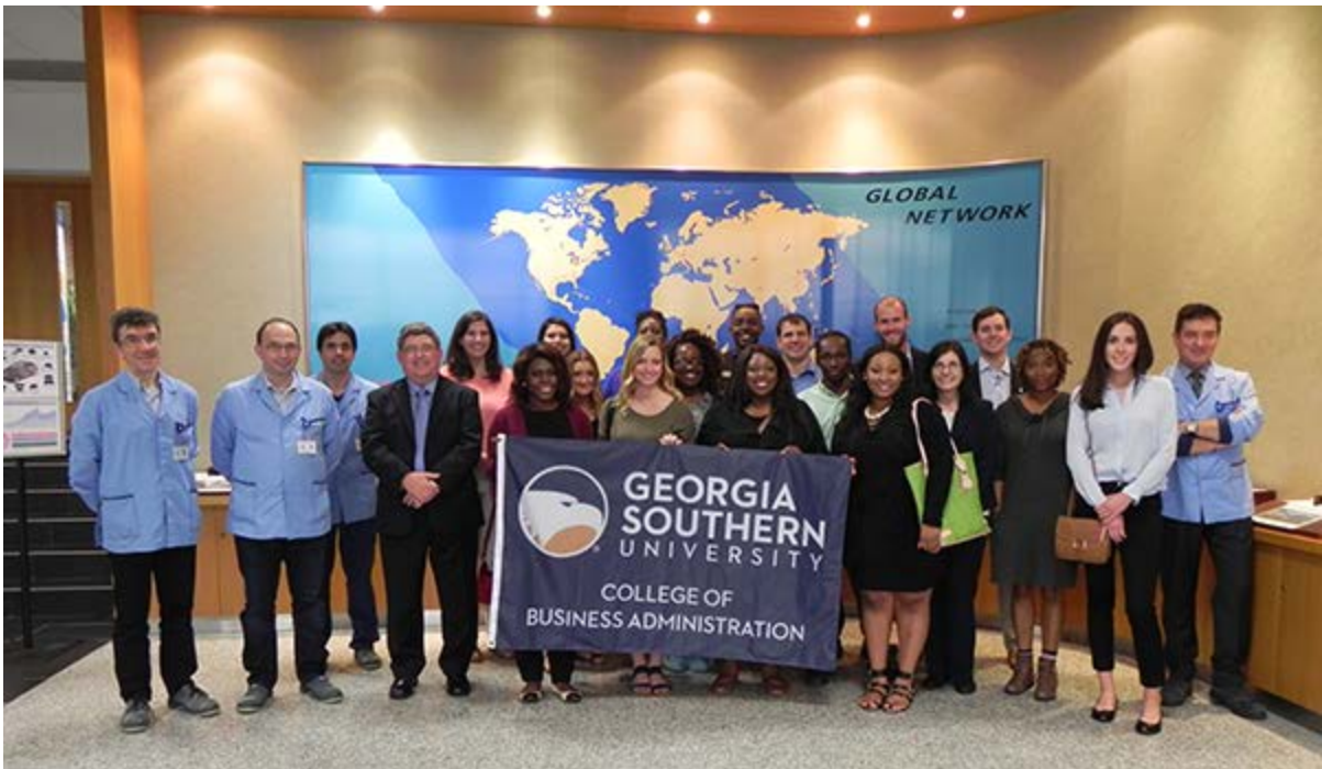
Students at Denso Manufacturing Barcelona