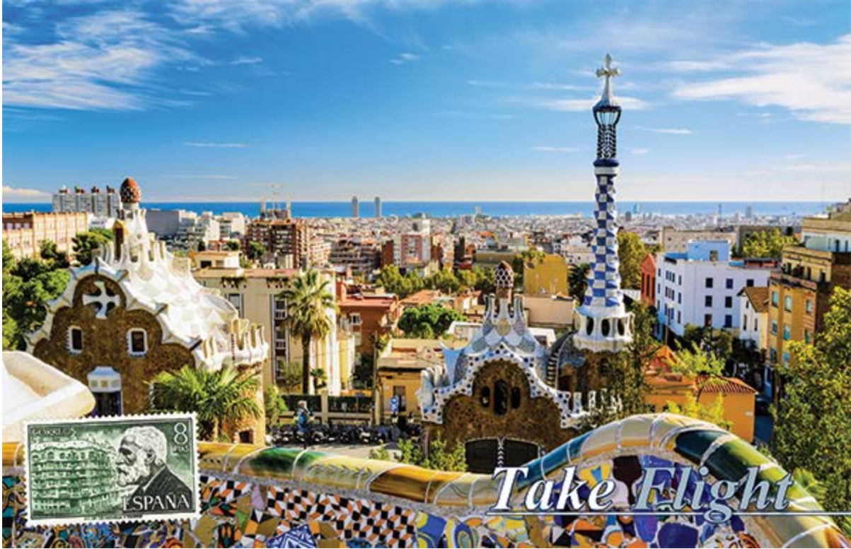
Business Abroad in Barcelona & Madrid, Spain