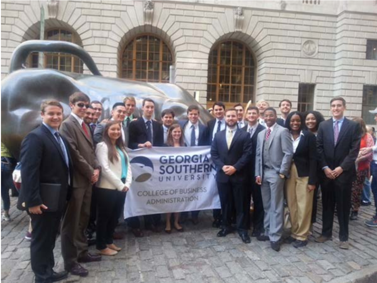
Students at the Wall Street Bull