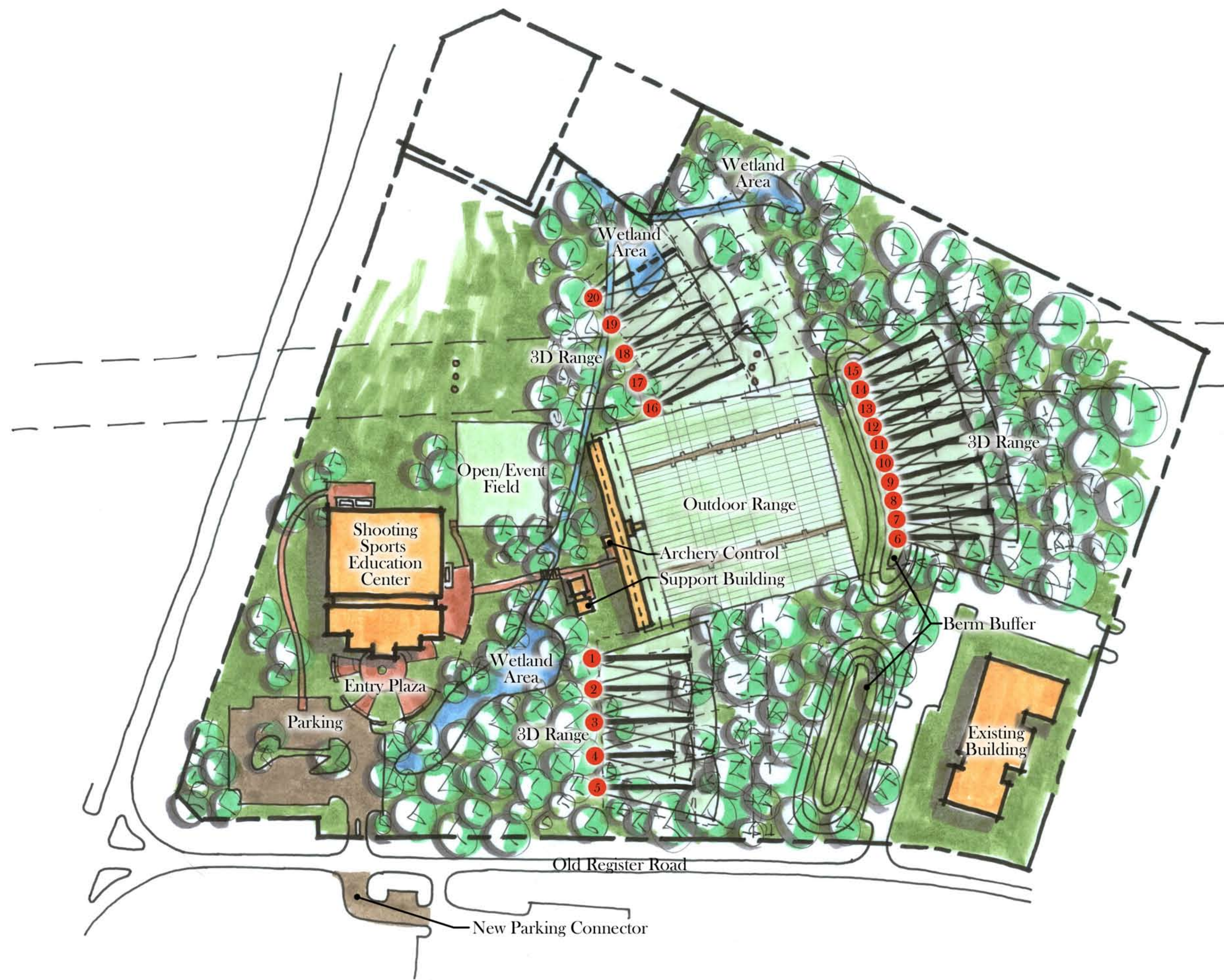
Site Plan - Scheme 6