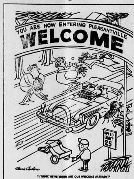
The Traveler Service

Speed killed or injured almost a million persons in 1961.