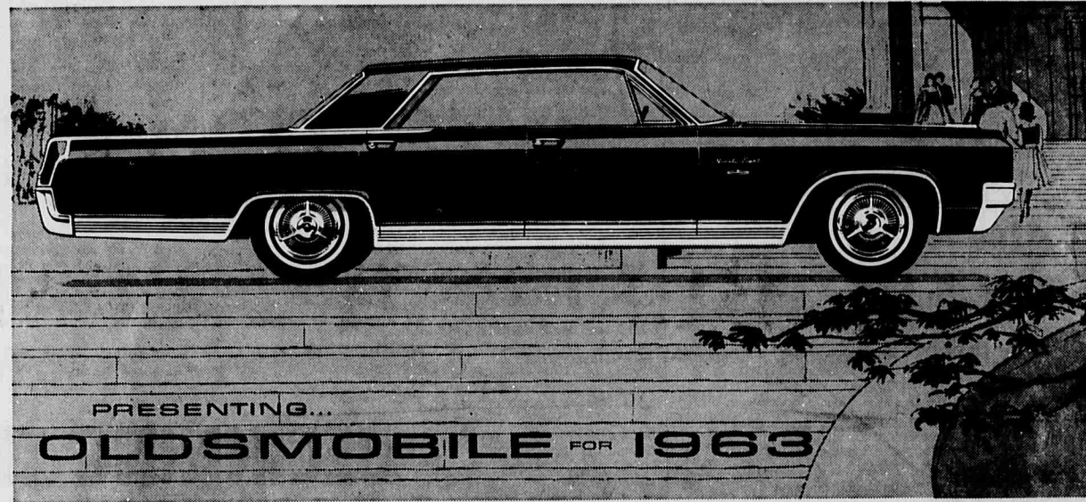
PRESENTING... OLDSMOBILE FOR 1963 Here's the year's most tasteful combination of elegance and performance—Oldsmobile for 1963! Wide new choice of exciting body styles! Stunning interior detailing! Responsive V-8 engines with up to 345 h.p. There's even a new T-position Tilt-A-Way Steering Wheel, optional at extra cost on all full-size models. See and drive the style-leading 1963 Oldsmobile—now on display at your local Oldsmobile Quality Dealer's!