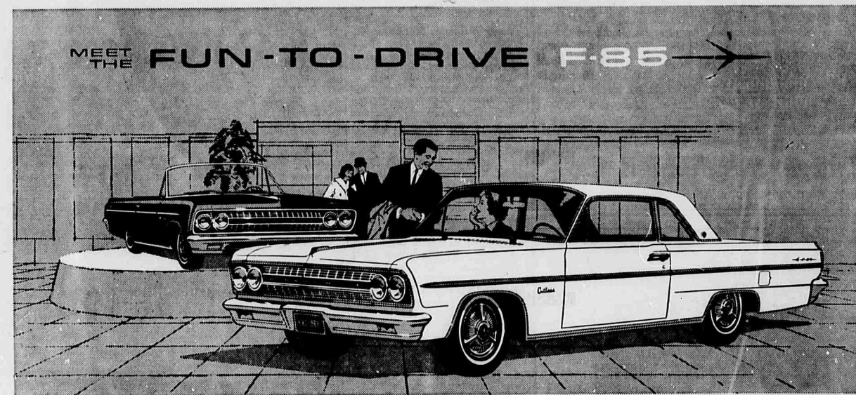
MEET THE FUN-TO-DRIVE F-85 Exciting new blend of beauty and action... In the low-price field! SEE YOUR LOCAL AUTHORIZED OLDSMOBILE QUALITY DEALER

Woodcock Motor Co., Inc. 108 Savannah Ave. DON'T MISS THE AWARD-WINNING "GARRY MOORE SHOW" • TUESDAY NIGHTS • CBS-TV!