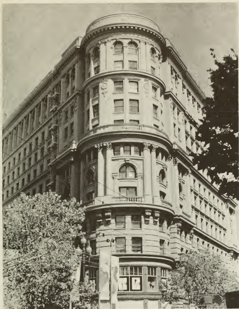
Monolith Des Purcell