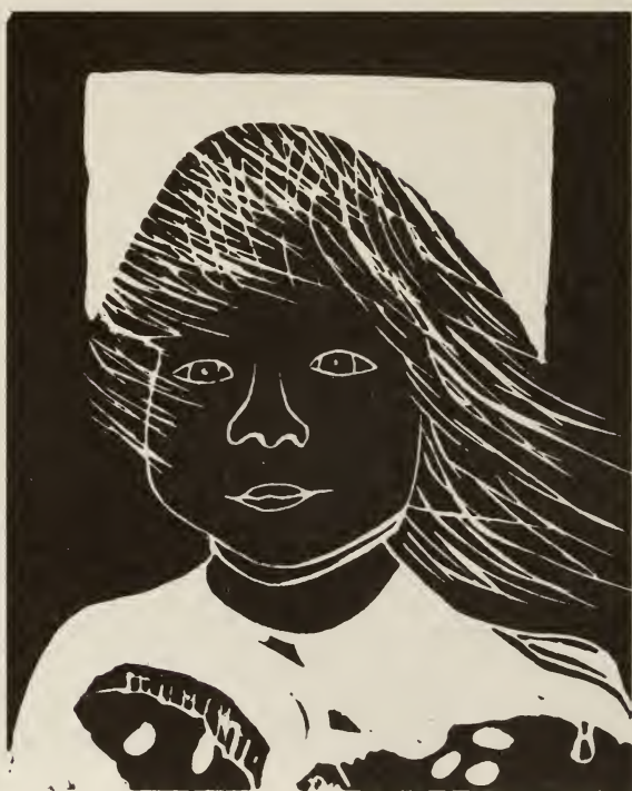
Windblown Ivy with Watermelon Shirt Phil Kandell