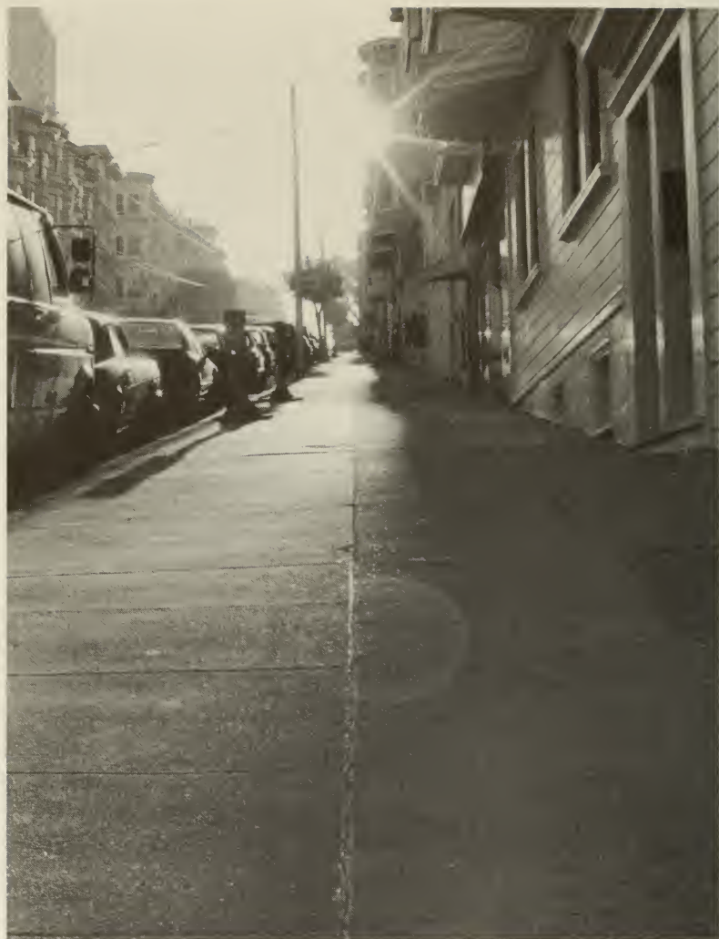
Sunset Boulevard Des Purcell