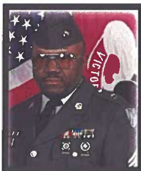
Retired Army-(SFC) Sergeant First Class