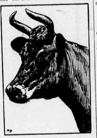
JACOBA IRENE. 1908, she freshened again, and her record for this third year is 17,273 pounds of milk containing 654.1 pounds of fat.

In the District Court of the United States for the Eastern Division of the Southern District of Georgia.