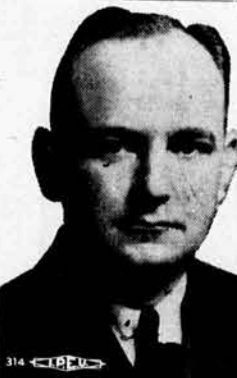
ATTORNEY GENERAL ELLIS G. ARNALL