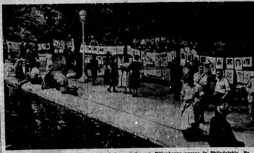
Art flapped on clotheslines as a brisk wind swept through Rittenhouse square in Philadelphia, Pa., recently. It was the annual three-day outside exhibit sponsored by the Art League of Philadelphia. Several hundred oils, water colors and etchings were on display and for sale. Thousands of interested spectators filed past the displays.