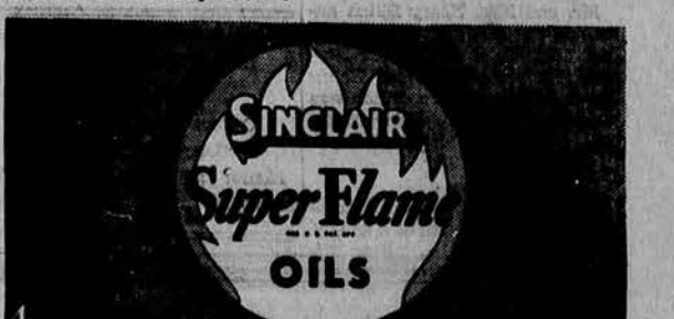
... order another drop of fuel oil, phone us. You'll like our reliable delivery service.

Agent Sinclair Refining Company (Inc.) "SINCLAIRIZE FOR SAFETY AT YOUR NEARBY SINCLAIR DEALER"