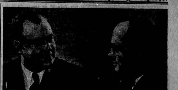
These men are engineers in Sinclair's Burner Laboratory. They test...