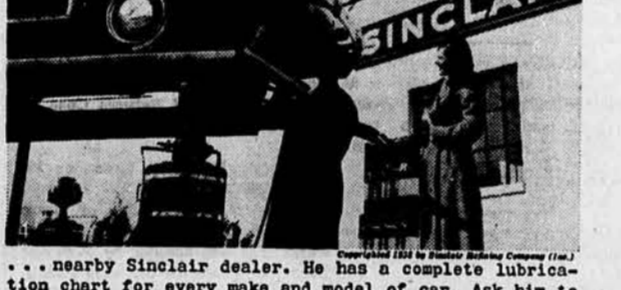
... nearby Sinclair dealer. He has a complete lubrication chart for every make and model of car. Ask him to show you the lubrication chart for your car. You'll like the way he treats you.