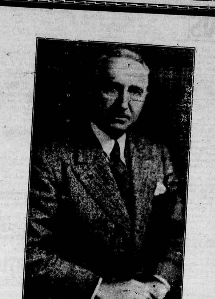
SENATOR WALTER F. GEORGE