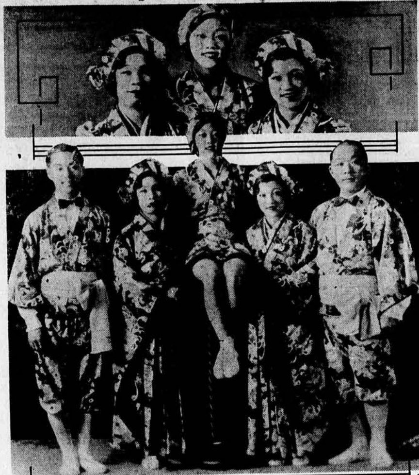
Direct from the Orient, the Great Eno Japanese Troupe will present their renowned Risley Act.