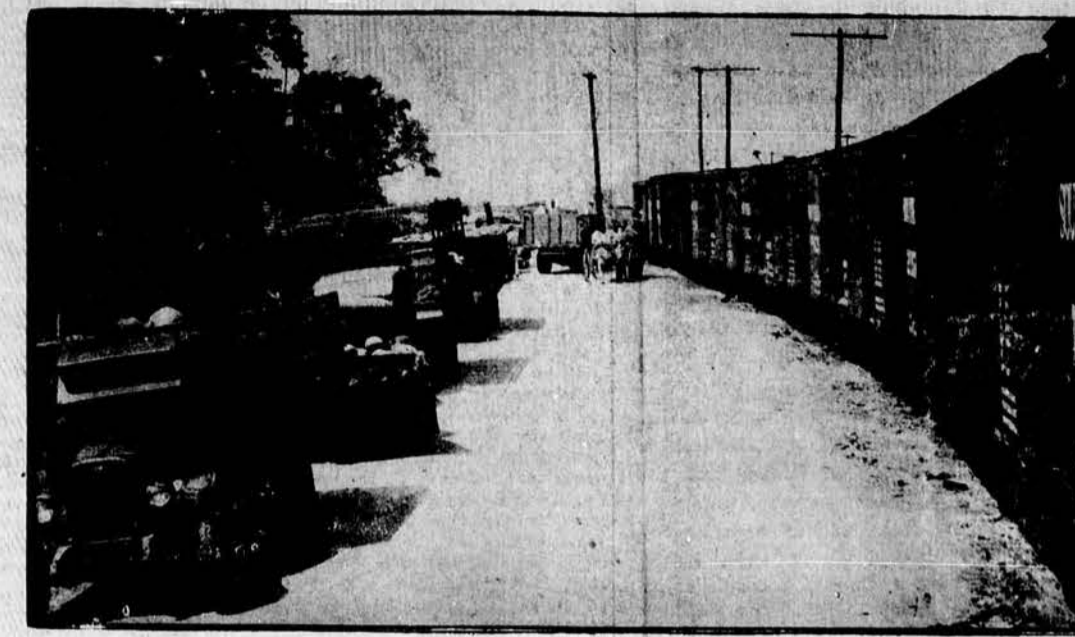
Watermelons began moving in carloads from Bulloch county this year since the Sherwood Railroad has been discontinued. The Sherwood operated through one of the largest watermelon sections in the state and growers from that section are now bringing their melons to Statesboro.