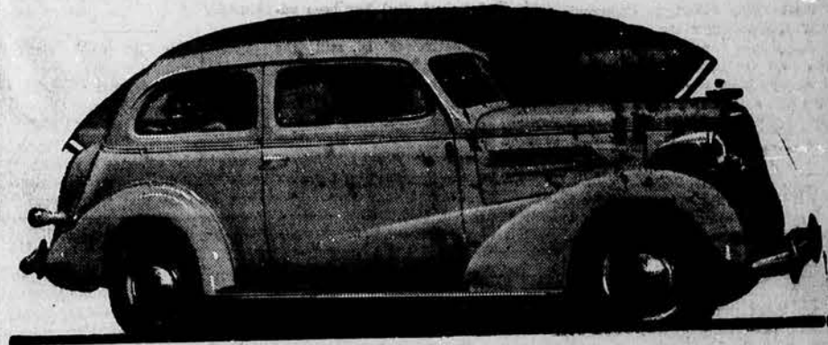
Choice of 2-door Standard 1937 Chevrolet Marsh Chevrolet Co., Inc., Dealer