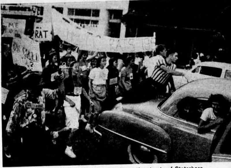
Teachers College Rat Day Parade on the streets of Statesboro