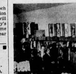
STATESBORO'S NEWEST STORE, shown here on opening day. The scene shows Bulloch county shoppers in J. L. Hodges' store on opening day recently. The new store is located on South Main street next to the Statesboro Telephone Co. building.

The scene shows Bulloch county shoppers in J. L. Hodges' store on opening day recently. The new store is located on South Main street next to the Statesboro Telephone Co. building.