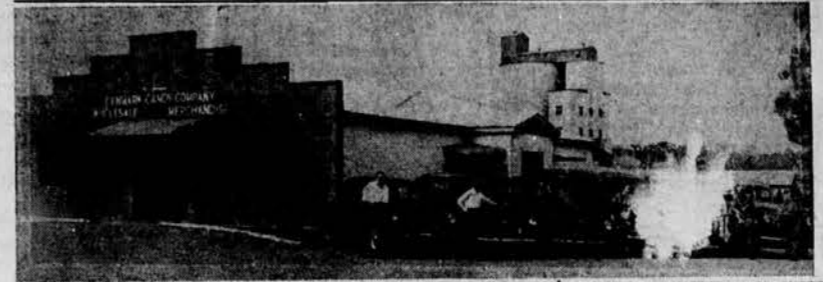
PROGRESS - Above is shown the structure which houses the Denmark Candy Company today. Below appears the small building in which the company began business in 1939.

Denmark Candy Co. To Hold "Open House" From the back seat of an automobile in 1939 to the modern 40 by 60 foot concrete building in 1949 is the story of progress of the Denmark Candy Company - "local boys making good." From the back seat of an automobile in 1939 to the modern 40 by 60 foot concrete building in 1949 is the story of progress of the Denmark Candy Company - "local boys making good."