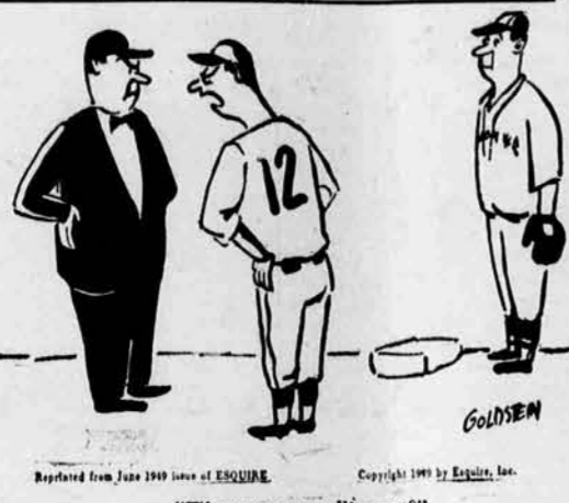
Who are you calling out?

NURSERY GROUP GROWING The nursery group now includes more than 60 members. It has become one of the most popular phases of the recreation program.