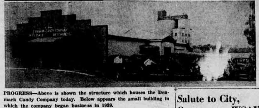
PROGRESS - Above is shown the structure which houses the Denmark Candy Company today. Below appears the small building in which the company began business in 1939.