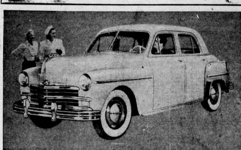
Plymouth's new special deluxe four-door sedan (above). Throughout the new Plymouth line beautifully streamlined bodies are lower and narrower, seats are wider and headroom greater. At the same time overall exterior dimensions are reduced, but wheelbase has been lengthened to 118 inches and glass area is increased. Horsepower is raised to 97. All fenders flow gracefully into the body they are detachable for ease in repair.

YOU ARE INVITED TO SEE the New PLYMOUTH On Display Friday, March 18 At the Showrooms of Your DODGE — PLYMOUTH DEALER LANNIE F. SIMMONS and DeSOTO — PLYMOUTH DEALER EVERETT MOTOR COMPANY Statesboro, Georgia