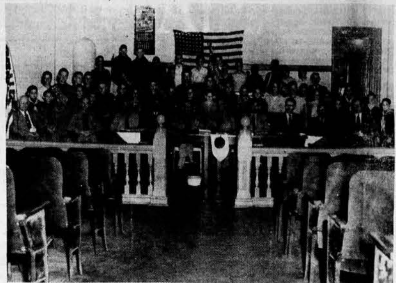
BULLOCH COUNTY BOY SCOUTS will be honored Tuesday night, October 19, when they hold the regular Fall Honor Court. The photo shows Statesboro and Bulloch County Boy Scouts at their last Honor Court, at which they received their advancement badges and merit badges. All Scouts and their parents are invited to attend the Honor Court next week.