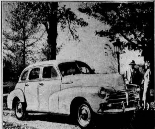
The over-all simplicity and massiveness of the new 1948 Chevrolet is well shown in this three-quarter view of the Fleetmaster Sport Sedan. Fenders, hood, body and door panels all blend; and the crease moulding, below the windows, is wider than that used in previous models. Note the new T-shaped chrome center bar on the radiator grille.

Friday evening, January 2. Decorations employed the Sigma Chi emblem and colors, blue and gold, in a most effective manner. Bill and Bob Holland drew the large emblem which was used over the mantel. Before the first place blue Greek letters, against a white background made an imposing screen. Streamers of blue and gold crepe paper extended from the center light to the corners of the club room and bordered the ceiling.