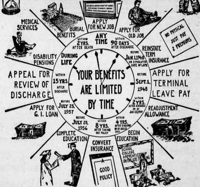
This time table of veterans' benefits was issued by the Employment Security Agency of the Georgia Department of Labor, which suggests you keep it for handy reference or post it on your bulletin board.