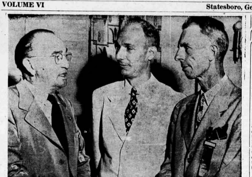
HEAD GEORGIA EDITORS - New officers of the Georgia Press Association, elected at the group's sixtieth annual session at Savannah Saturday...