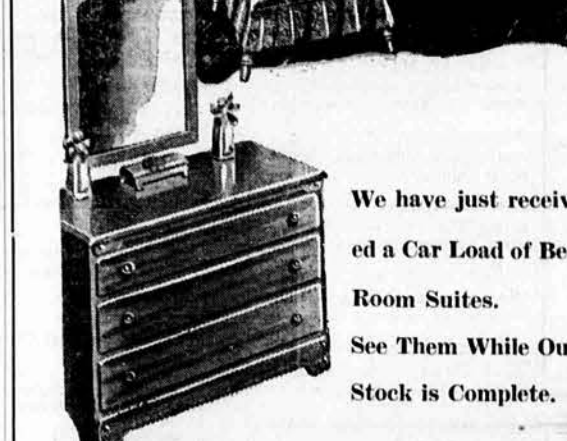
MODERN-IN A NEW BEDROOM GROUP - A suite that shows how smart, yet how beautifully simple good modern can be. Y-matched veneers in contrasting tones fashion this really fine suite that is an unusual value.

Chifferobes And Chiffoneers Drawers, LIVING ROOM SUITES, DINING ROOM SUITES, OUT-DOOR FURNITURE, FLOOR LAMPS, TABLE LAMPS, OCCASIONAL CHAIRS