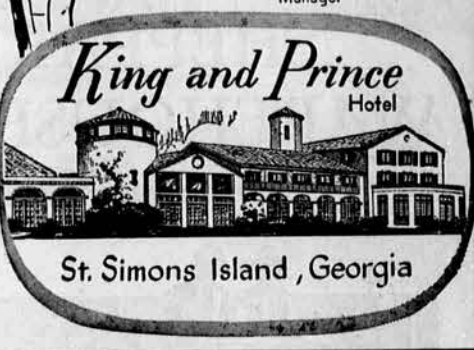
King and Prince Hotel St. Simons Island, Georgia