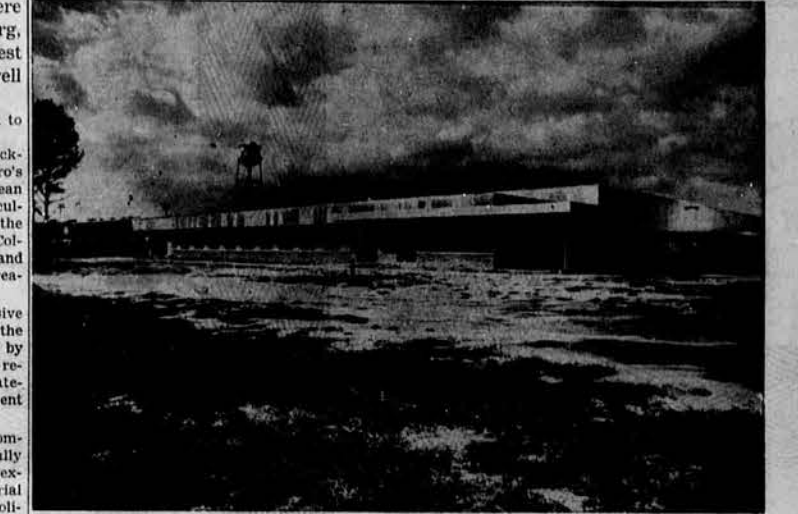
TO BE OCCUPIED BY The Rockwell Manufacturing Company of Pittsburg, Pa. The new manufacturing plant built by the Bulloch County Development Corporation is located on U. S. 301, North of Statesboro at the airport.

The Easter Seal Appeal is sponsored annually by the Georgia Society for Crippled Children and Adults as part of a nationwide campaign similar to that conducted in forty-eight states, the District of Columbia, Alaska, Puerto Rico and Hawaii.