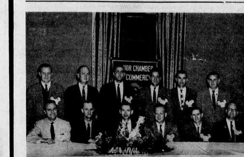
"EXHAUSTED ROOSTERS" of the Statesboro Junior Chamber of Commerce were honored in special ceremonies held at the Country Club on Tuesday night of last week.

Portal High School's debating team were declared the winners of the district debate in the C classification for the second year on Monday last week at the Marvin Pittman High School here.