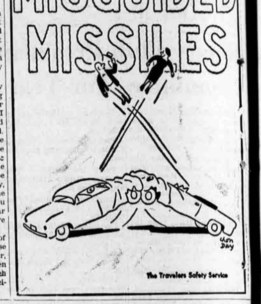
The Traveler Safety Service