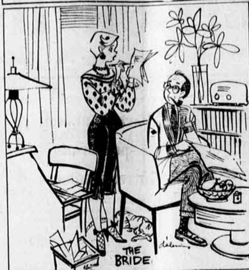
"I'm afraid you didn't supply me with enough means for me to live within, again, dear!"