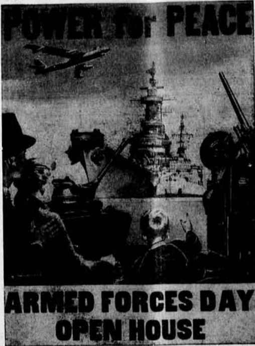
OFFICIAL POSTER-ARMED FORCES DAY-MAY 21, 1955 - By Presidential proclamation, the third Saturday in May is Armed Forces Day.