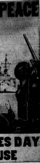
ARMED FORCES DAY OPEN HOUSE