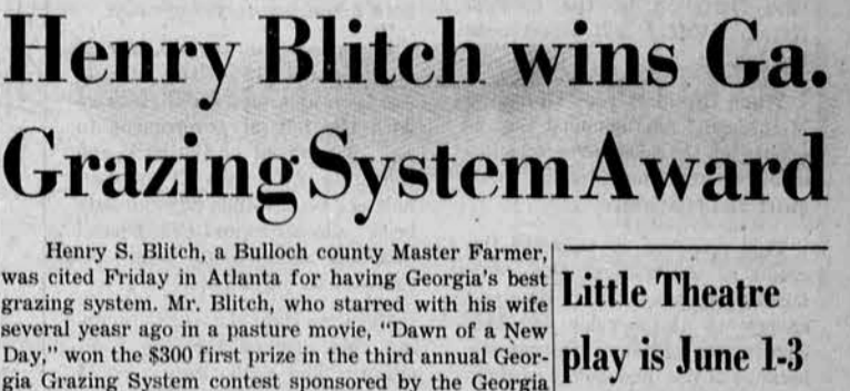
Scheduled for these three days is J. B. Priestly's unusual play, "The Long Mirror," to be presented in the Masonic Hall on South Main street at Cherry street, the action of the play will be observed by the audience from all sides of the stage as play characters act their parts in the center arena.

Registration for swimming classes will be held during the morning hours of June 15, 16 and 17. All members of the Statesboro Recreation Department on Fair Road for the 1955 swimming season. Classification will be held for on Monday and Tuesday, June 20 and 21, with classes beginning on Wednesday, June 22.