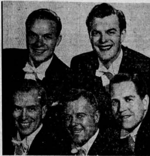
MEN OF SONG HERE TUESDAY NIGHT