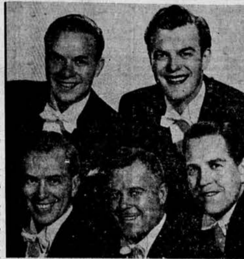
MEN OF SONG HERE TUESDAY NIGHT