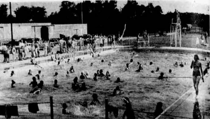
Swimming Pool Opens Sunday May 16, at 3:00 p. m.

Come Out To NATH'S TV SALES & SERVICE For the Great DEMONSTRATION SALE Friday and Saturday MAY 14 - MAY 15 And See The Complete Line of Bendix LAUNDRY EQUIPMENT See It In Operation OPENING SPECIAL Absolutely Free a Rigid Sit Down to Iron Ironing Table With the Purchase of Bendix Economat, Completely Automatic Washer Selling For ONLY $229.95 Come In Today Ironing Table Offered for limited Time Only NATH'S TV SALES & SERVICE (Next to Skate-R-Bowl, on U. S. 301, South of Statesboro)