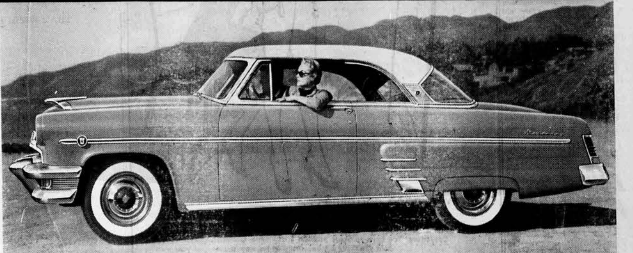
PACE-SETTING STYLING KEEPS MERCURY AHEAD OF ITS FIELD...HELPS KEEP TRADE-IN VALUE HIGH

Let us show you how some cars price-tagged less than a Mercury can cost more—when you figure the deal we can make on your present car, over-all operating cost, and Mercury's proved record of high trade-in value.