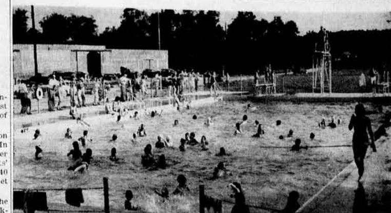
Swimming pool and wading pool set for opening Sunday, May 16

STATESBORO, GEORGIA, THURSDAY, MAY 6, 1954