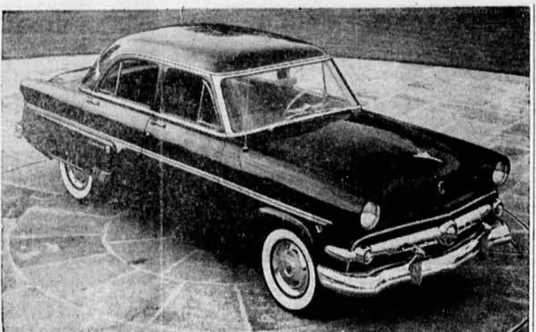
This 1954 Ford Crestline Ford sedan—new this year—has interior beauty and new power aids usually found only in costly limousines. Its smart new grille has a characteristic Ford center spinner, recessed parking lights and jet-type air scoop. Like all 1954 Ford passenger cars it has new ball-joint front suspension for easier handling and the choice of either Ford's completely new 130-h.p. V-block 8 engine or the new 115-h.p. I-block Mileage Maker Six. For ease and driving pleasure it has power steering, power brakes, power operated windows and front seat, plus Fordomatic or overdrive, available at extra cost.