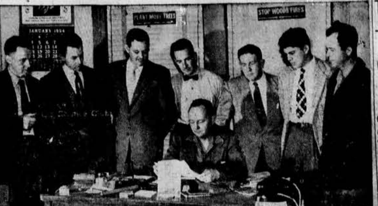
THEY'LL HELP PLANT 10,000 pine trees for the Explorer Scouts at Camp Brannen near Metter during National Scout Week, in February.