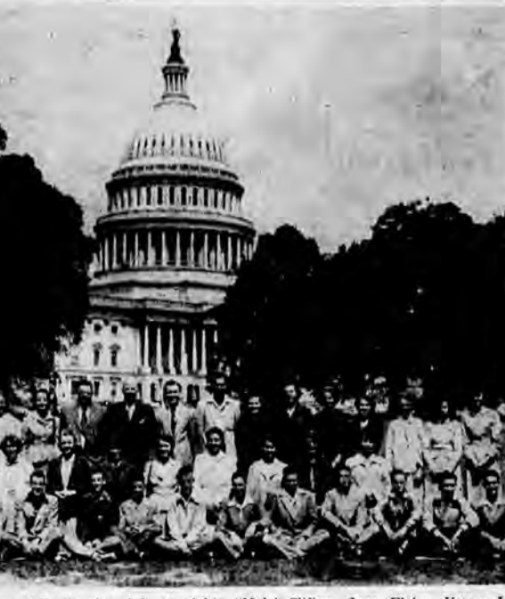
Members of the senior class of Brookfield High School...