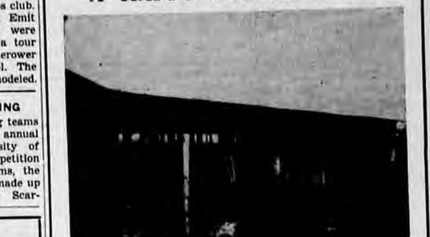
The photograph shows Mrs. W. Erastus Deal of RFD 4, Statesboro, with her 599 Parmenter Red Pullets. Seven weeks ago she started with 640. The average weight at the time of the photograph was 1.65 pounds. There are few undersized pullets. She states that the pullets were raised on the "Purina Program."

It's a Good Program—the Purina Program. You, too, can get best results on the Purina Program for your poultry and livestock.