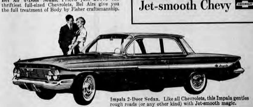
Impala 2-Door Sedan. Like all Chevrolets, this Impala gentles rough roads (or any other kind) with Jet-smooth magic.

See the new Chevrolets at your local authorized Chevrolet dealer's One-Stop Shopping Center