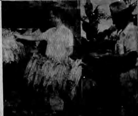
THE HARVESTING OF THE TOBACCO MARKET TO OPEN ON THURSDAY, JULY 27, IN STATESBORO AND OTHER MARKETS IN THE FLUE-CURED TOBACCO BELT IN GEORGIA AND FLORIDA.