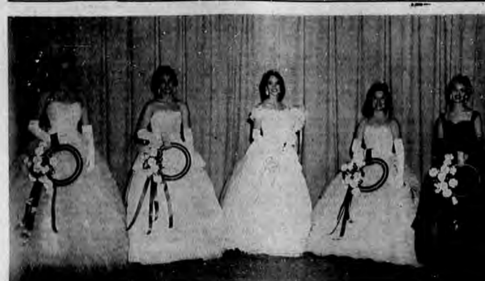
"MISS GEORGIA SOUTHERN COLLEGE" of 1961 and her court as they appeared the night of the beauty contest, January 29, during the Homecoming weekend.

VOLUME XX—Established March 26, 1937—P.O. Box 210 STATESBORO, GEORGIA, THURSDAY, FEBRUARY 9, 1961 NUMBER 13