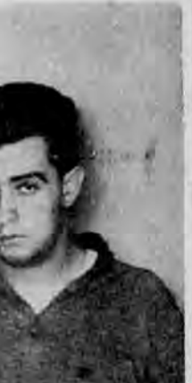
Portrait of a young man, likely related to the 4-H clubs article.