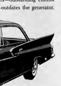
This is the Newport 2-Door Hardtop

61's most surprising price tag won't be found on a jr. edition. It's on Chrysler's new full-size beauty... the Newport. And you get all this: Unibody—solid, single-unit design, a price-class exclusive. Firebolt V-8—delivers peak performance on regular. Torsion bars—outstanding control is yours thanks to this remarkable front suspension. Alternator—outdates the generator, produces current even at idle.