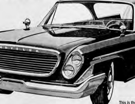
This is the Newport 2-Door Hardtop

61's most surprising price tag won't be found on a jr. edition. It's on Chrysler's new full-size beauty... the Newport. And you get all this: Unibody—solid, single-unit design, a price-class exclusive. Firebolt V-8—delivers peak performance on regular. Torsion bars—outstanding control is yours thanks to this remarkable front suspension. Alternator—outdates the generator, produces current even at idle.