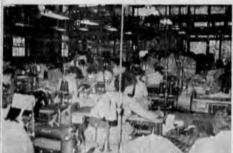
SHOWN HERE is part of the sewing operation at Marydell Styles Inc. plant on West Main Street.

Pretty little girls all over the United States and in Canada; Puerto Rico, Hawaii and Alaska are wearing pretty little dresses made here in Statesboro.