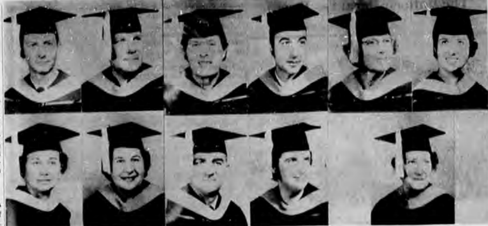
ELEVEN BULLOCH COUNTY TEACHERS who received master of education degrees at Georgia Southern College in graduation exercises on Thursday, August 18 in McCran Auditorium.

RECEPTION AT RECREATION CENTER Immediately following the ceremony a reception was held at the Fair Road Recreation Center.