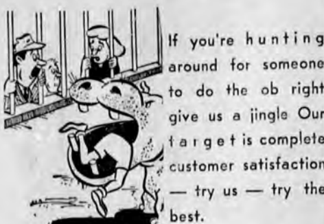
"Let your ball go, Kiro, we'll get you another one."

If you're hunting around for someone to do the ob right give us a jingle Our target is complete customer satisfaction — try us — try the best.