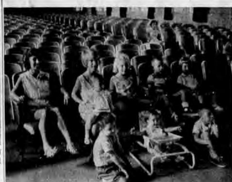
FRONT ROW CENTER seats are for mama's most appreciative audience who see rehearsal after rehearsal.