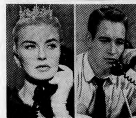
PAUL NEWMAN and JOANNE WOODWARD star in "From the Terrace" now showing at the Georgia Theatre, the final day being Friday, September 2.