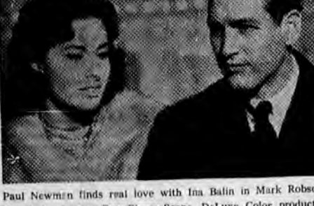
Paul Newman finds real love with Ina Balin in Mark Robson's Twentieth Century-Fox CinemaScope, Deluxe Color production of John O'Hara's searing novel "From The Terrace" beginning Sunday August 28, at the Georgia Theatre.

FOR SALE—1952 Plymouth. Good fishing cut. This week Special—$55.00. Altmann Pontiac Company, North Main Street, Statesboro, Georgia.