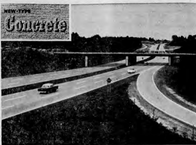
Built for tomorrow—here today! Relaxed riding on new-type concrete