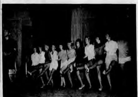
"GIRLS, IT'S one, two, three—KICK—Now try to do it ONE time together!"