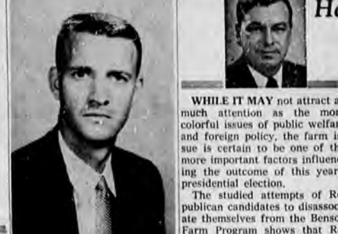
Herman Talmadge Reports From Washington