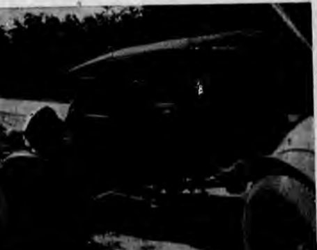
THE MODEL A FORD driven by Manassas Woodrum, age 72, of Garfield shown here at wrecker was about to tow away from the scene of the accident in which four people were killed Sunday night.