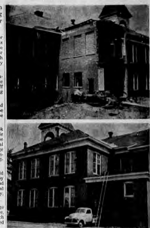
TOP PHOTO shows the old Statesboro High School Building on South College Street in the process of being renovated to provide additional classroom space for the Statesboro School. The section with openings will be torn away from the main building. The bottom photo shows the north side of the building where repairs on the roof is being done. The picture shows the windows of the second story being boarded up. This building was erected at the turn of the century. In 1923, the new high school building was completed on West Grady Street and this building became the grammar and elementary school.