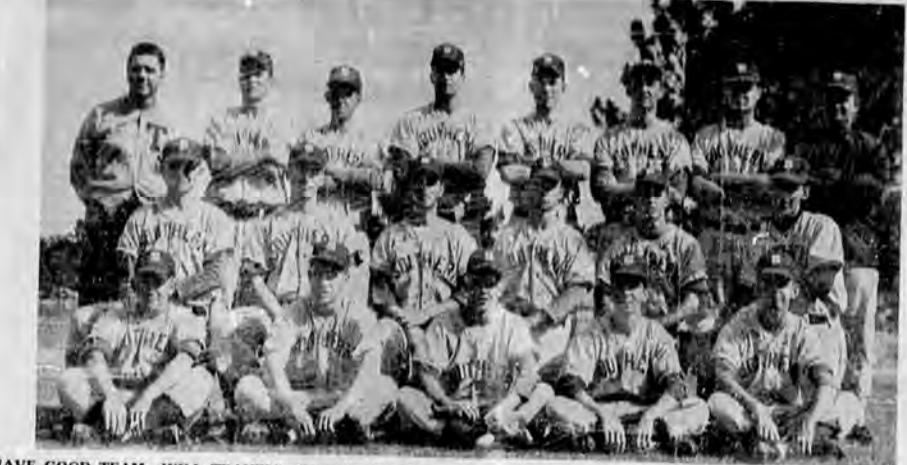
"HAVE GOOD TEAM—WILL TRAVEL" allows the baseball coaches of the Georgia Southern College team. Shown here are members of the 1960 team...