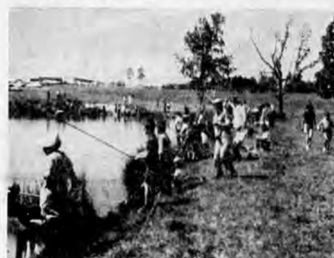
HERE IS MORE of them at another part of the Lake.

HERE IS A part of the Lake after the "storm" broke. Shown here are many of the kids fishing.