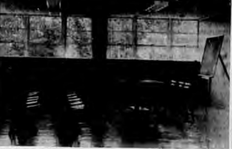
THE CONFERENCE room at the T. J. Morris Company's new IGA Warehouse on Northside Drive in Statesboro. Here it is that the company's salesmen and member grocers meet to study their problems.

Statesboro, Georgia, Thursday, April 5, 1960