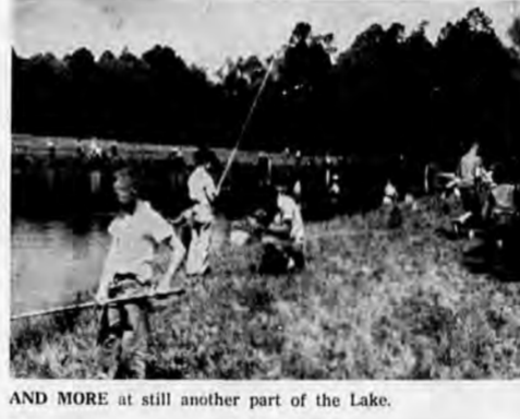
AND MORE at still another part of the Lake.