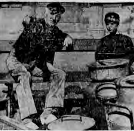
DONALD CRISP takes time from his daily milk route to point out something of interest in the city of Antwerp to his grandson by David Ladd, in this scene from "A Dog of Flanders." CinemaScope-Deluxe Color release, opening at the Georgia Theatre, Picture, taken from the famed classic novel by Ouida, was shot entirely in Belgium and Holland.