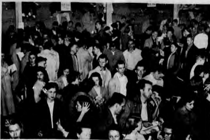
REGISTRATION AT GEORGIA SOUTHERN COLLEGE. Pictured above is the "mob scene" which takes place at the beginning of each quarter when students attempt to enroll in their courses. Approximately 1,000 students converge in the old Gym to encounter this ordeal.