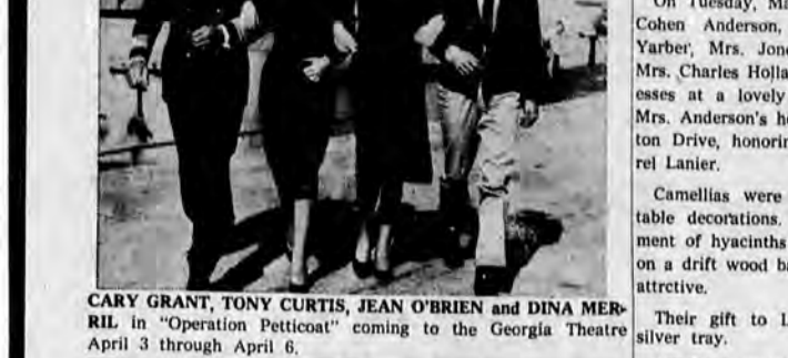
CARY GRANT, TONY CURTIS, JEAN O'BRIEN and DINA MERRILL in "Operation Petticoat" coming to the Georgia Theatre April 3 through April 6.