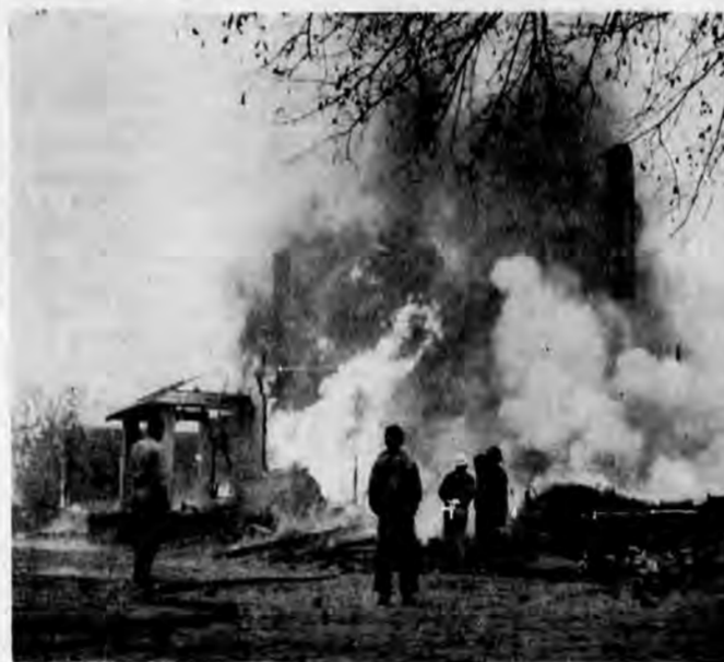
THIS IS HOW the William James Negro Elementary School looked about 8:15 o'clock Thursday morning, January 28.