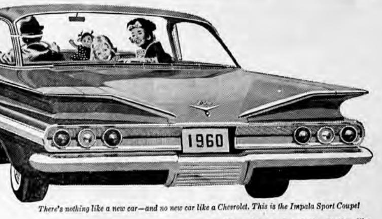
There's nothing like a new car—and no new car like a Chevrolet. This is the Impala Sport Coupe!

THIS IS YOUR GEORGIA Georgia was settled in 1773 by English settlers under the leadership of General James Oglethorpe. * * * Georgia was one of the original thirteen colonies and was one of the first four states to ratify the Constitution. * * * The steamship Savannah which sailed from Savannah for Liverpool on May 20, 1817, was the first steamship to cross any ocean.